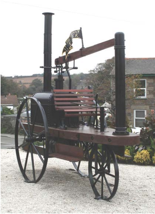
The static replica on the roundabout